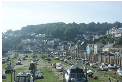
Looe with the tide out.